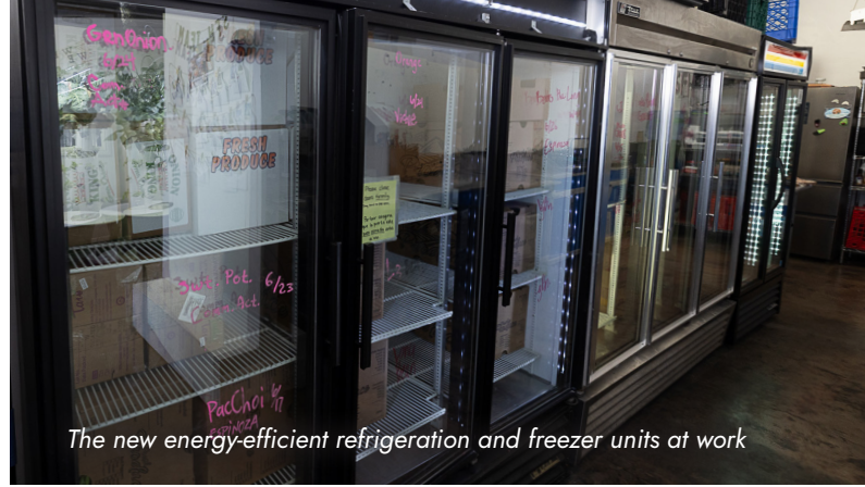
The new energy-efficient refrigeration and freezer units at work

In addition to the Fridge, the Food Hub is continuously working to create programming and services that directly combat food apartheid. These efforts are designed to reach Saticoy's most vulnerable populations—the unhoused, undocumented, senior citizens, and those living in multi-generational households.